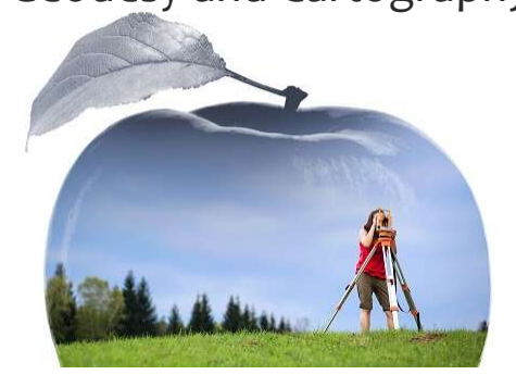
Geodesy and Cartography