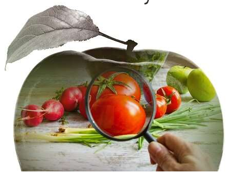
Food Qualiy Managment and Analysis