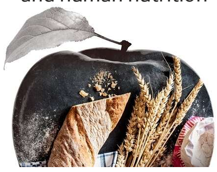
Food technology and human nutrition